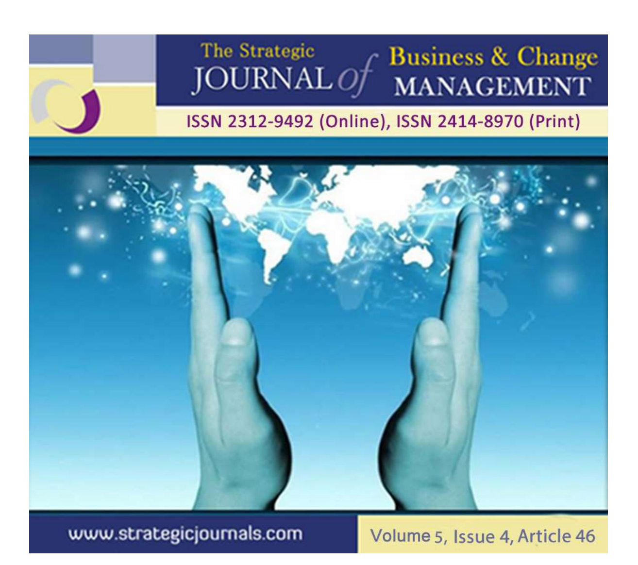
INFLUENCE OF COMPETITIVE STRATEGIES ON CUSTOMER SATISFACTION AMONG COMMERCIAL BANKS IN KENYA