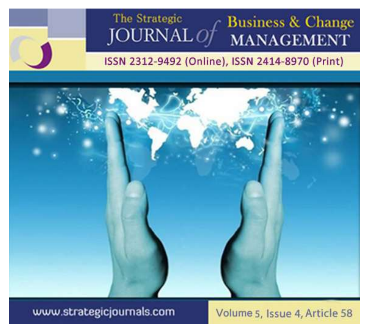
EFFECTS OF BANK SPECIFIC GUIDELINES ON FINANCIAL PERFORMANCE OF COMMERCIAL BANKS IN KENYA: A CASE OF KENYA COMMERCIAL BANK, NAIROBI COUNTY.