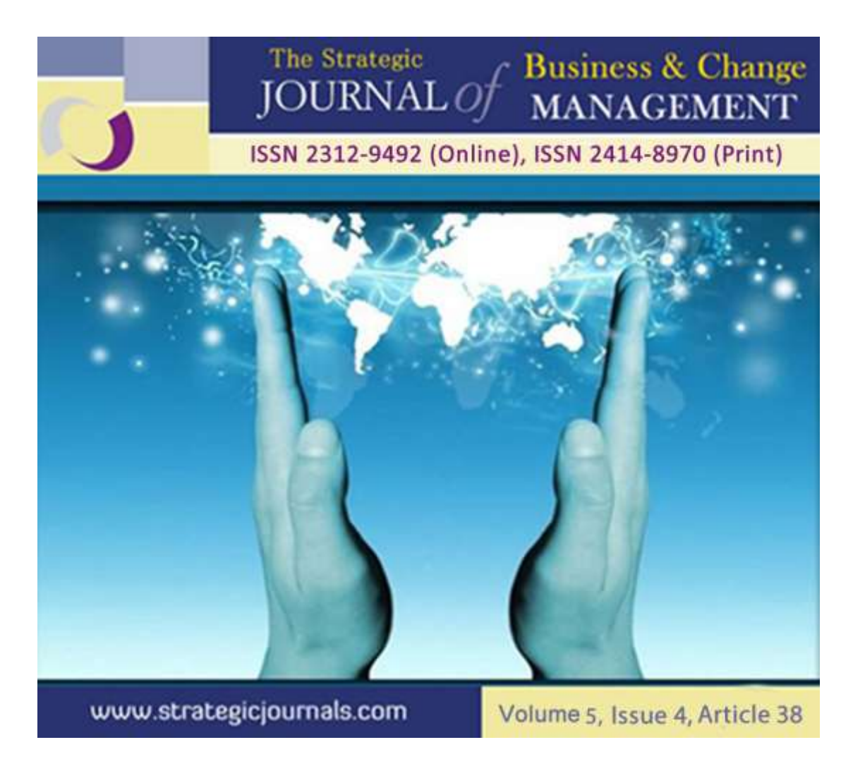
THE ROLE OF COMMUNITY-BASED ORGANISATIONS LOANS IN YOUTH ECONOMIC EMPOWERMENT: CASE OF MAKADARA SUB-COUNTY, NAIROBI CITY COUNTY, KENYA