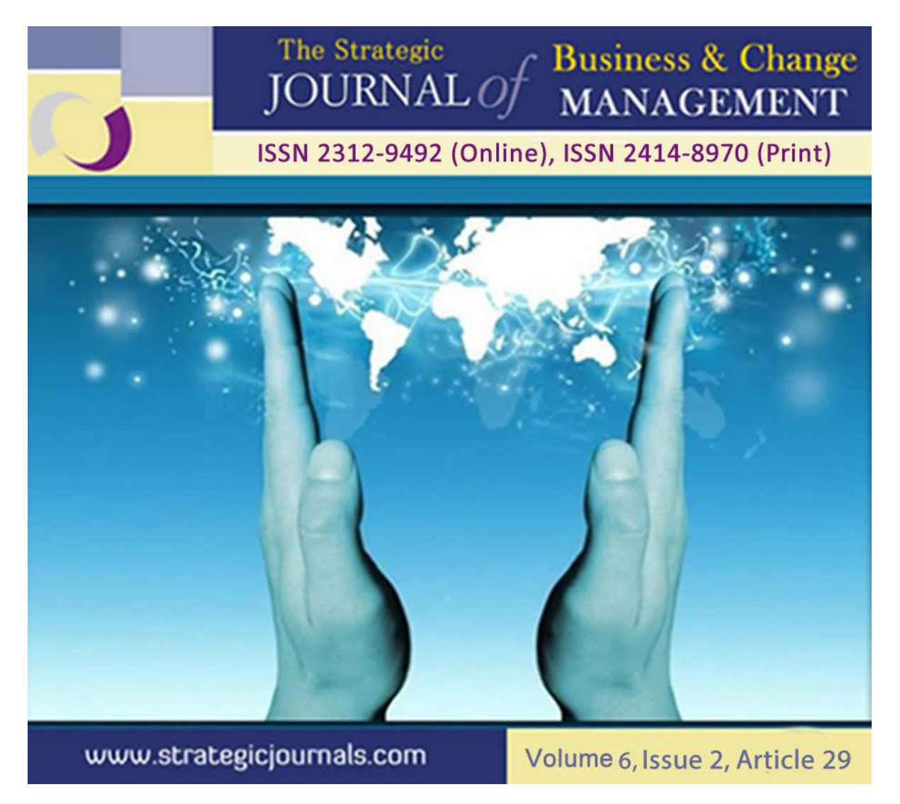
EFFECT OF PERFORMANCE APPRAISAL ON EMPLOYEE PERFORMANCE: A CASE STUDY OF NATIONAL HEALTH INSURANCE FUND