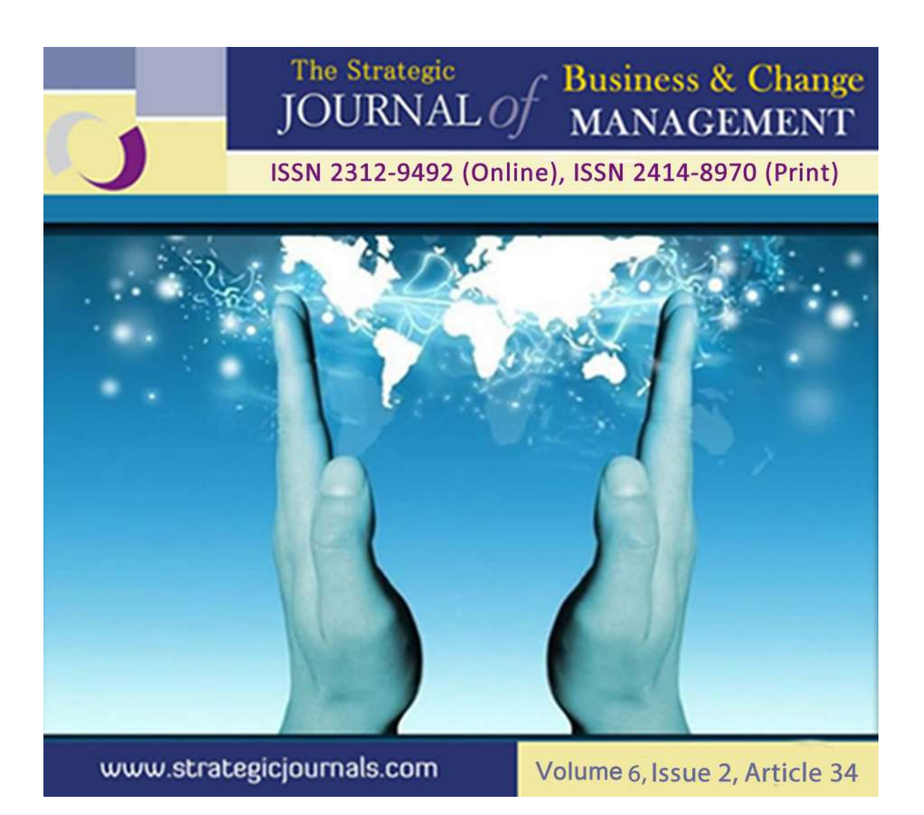
EFFECT OF INTEREST RATE CAPPING ON MARKET PERFORMANCE IN LISTED COMMERCIAL BANKS IN MOMBASA COUNTY, KENYA