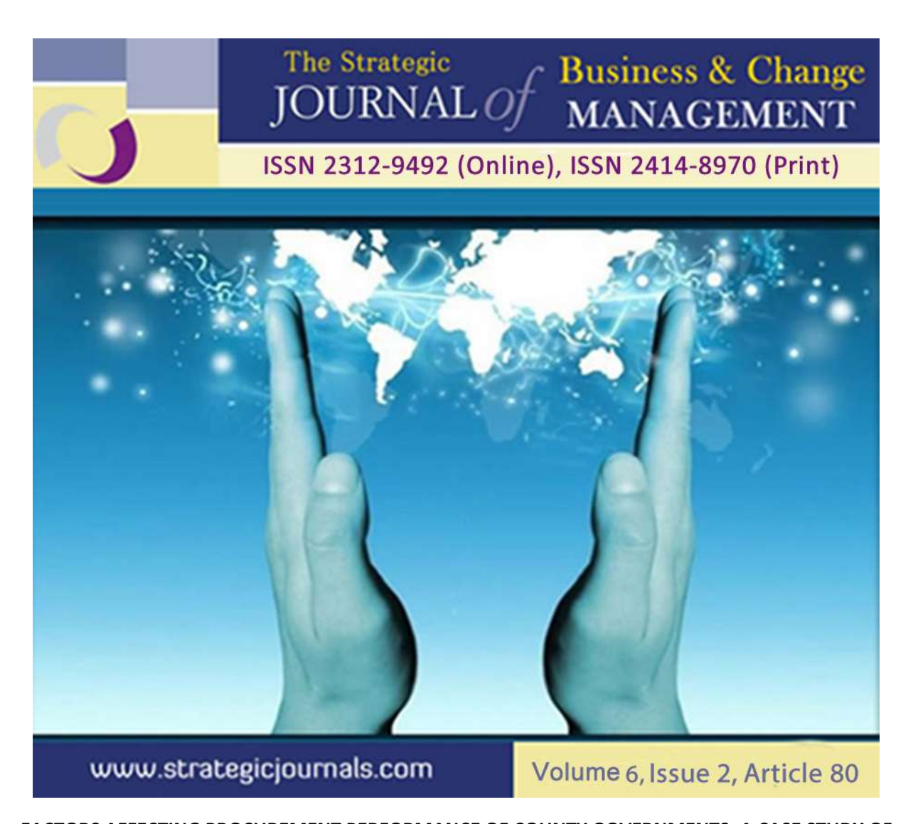
FACTORS AFFECTING PROCUREMENT PERFORMANCE OF COUNTY GOVERNMENTS: A CASE STUDY OF MOMBASA COUNTY