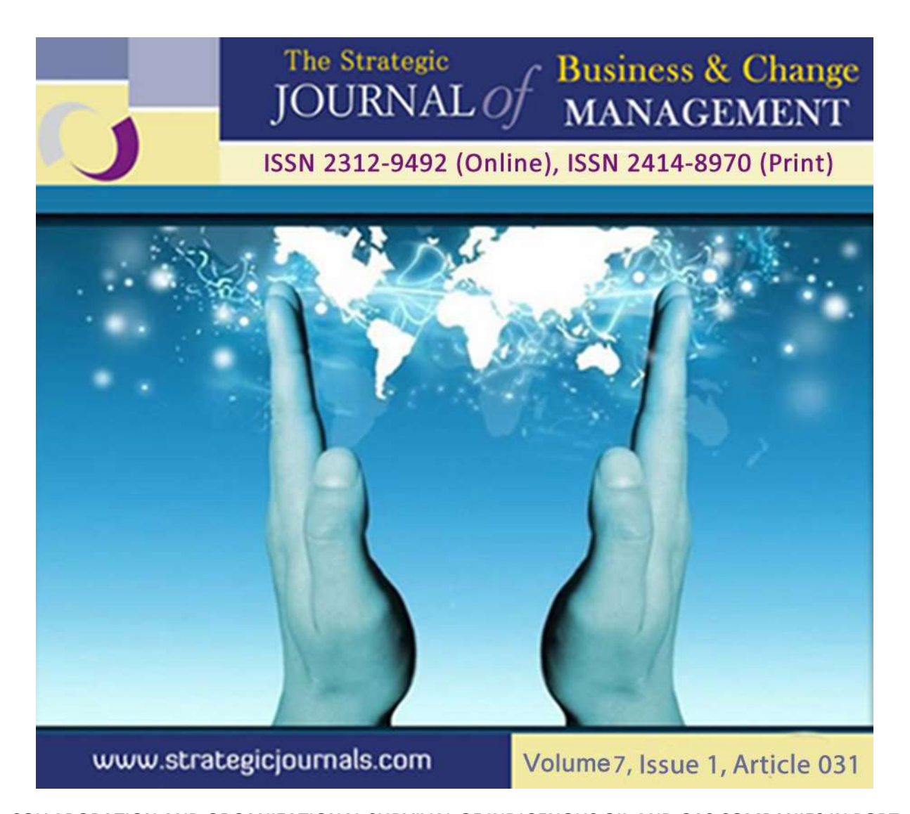
COLLABORATION AND ORGANIZATIONAL SURVIVAL OF INDIGENOUS OIL AND GAS COMPANIES IN PORT HARCOURT