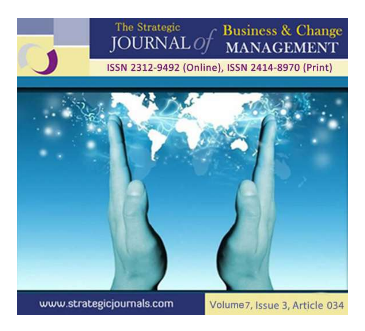
EFFECTS OF SUPPLIER APPRAISAL PRACTICES ON PERFORMANCE OF MANUFACTURING FIRMS IN NAIROBI COUNTY, KENYA