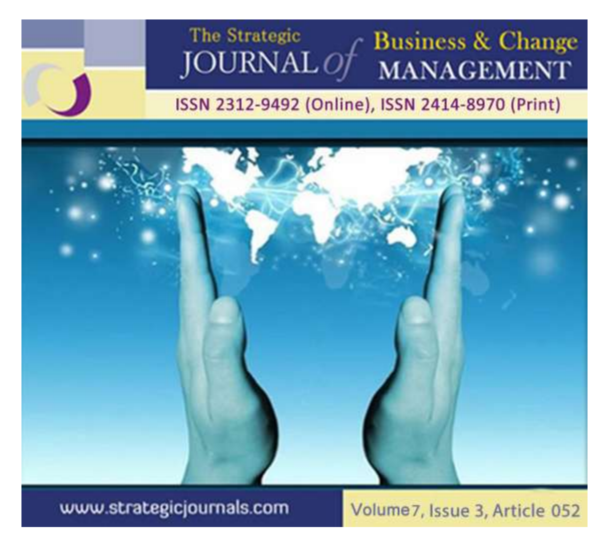
EFFECT OF STRATEGIC PLANNING PRACTICES ON PERFORMANCE OF STATE CORPORATIONS IN KENYA: A CASE OF AGRICULTURAL FINANCE CORPORATION