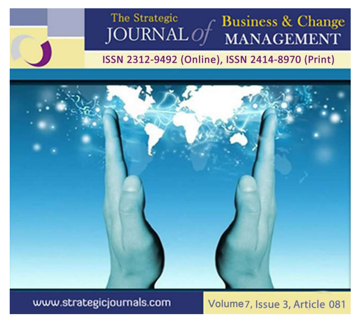
INFLUENCE OF MONITORING AND EVALUATION ON PROJECT PERFORMANCE IN KENYA AGRICULTURAL AND LIVESTOCK RESEARCH ORGANIZATION