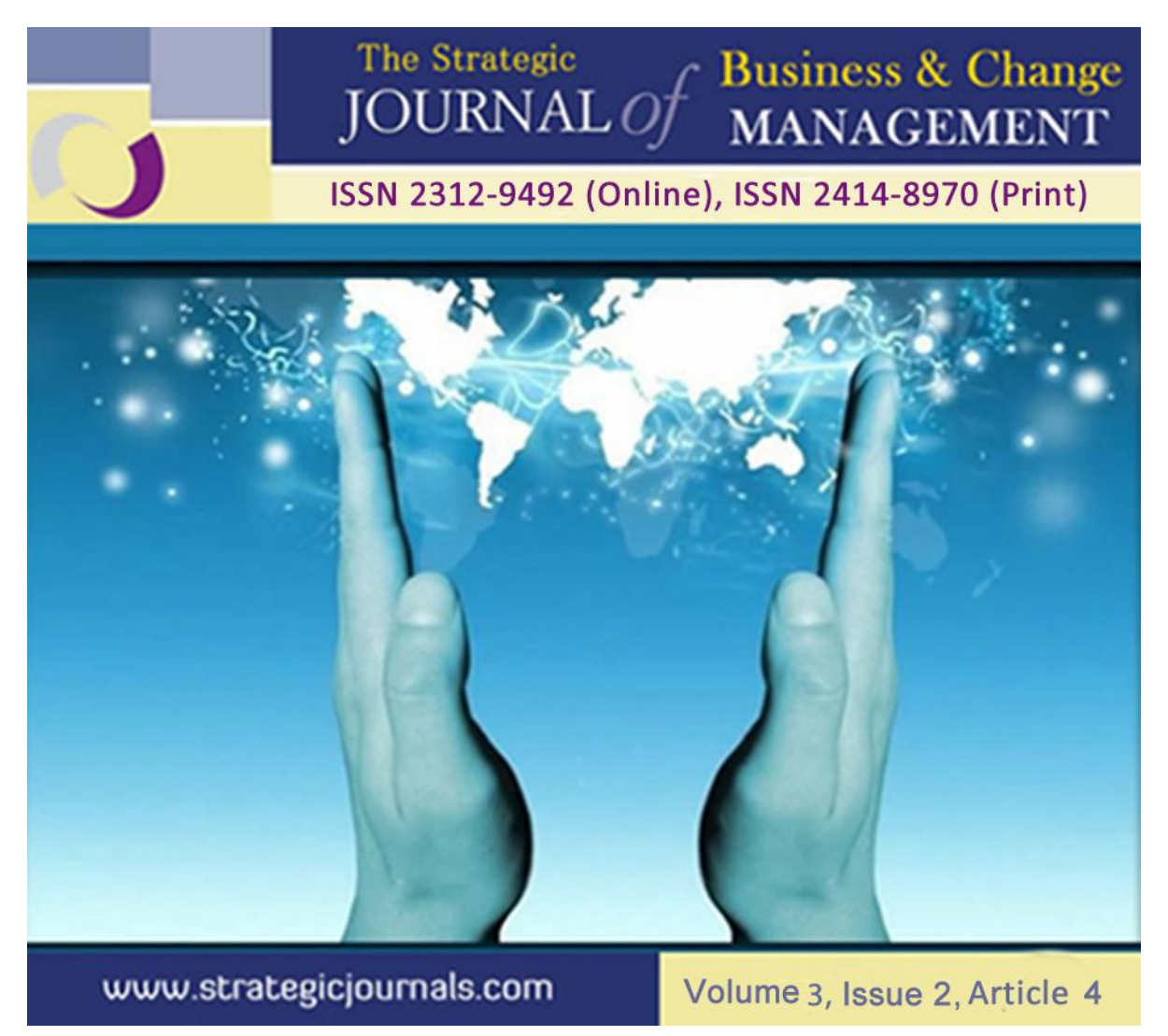
DETERMINANTS OF PROVISION OF QUALITY SERVICES IN COUNTY GOVERNMENTS IN KENYA: A CASE OF NAIROBI COUNTY