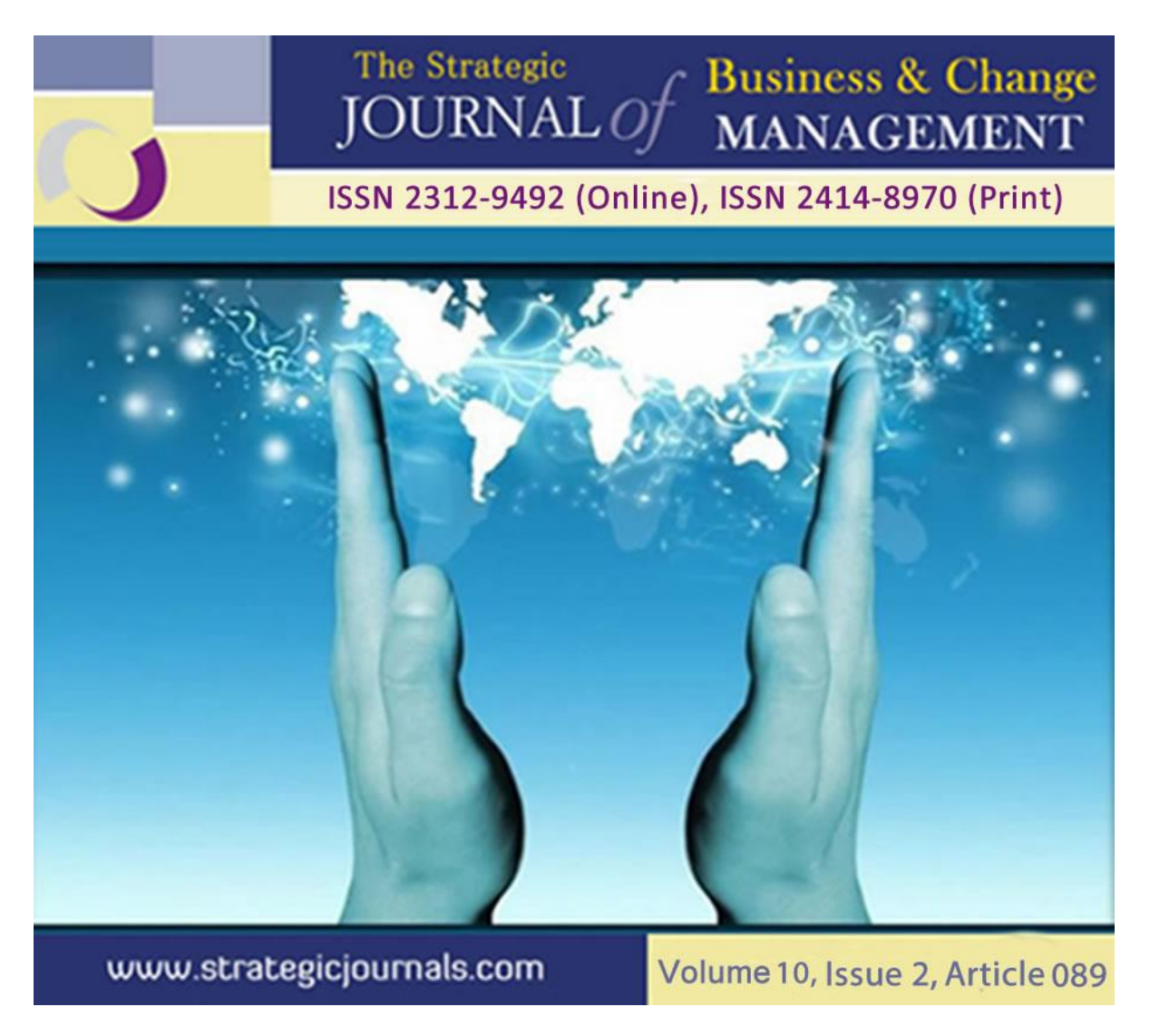
STAKEHOLDER INVOLVEMENT AND PERFORMANCE OF CONSTRUCTION PROJECTS IN PUBLIC UNIVERSITIES IN NAIROBI CITY COUNTY