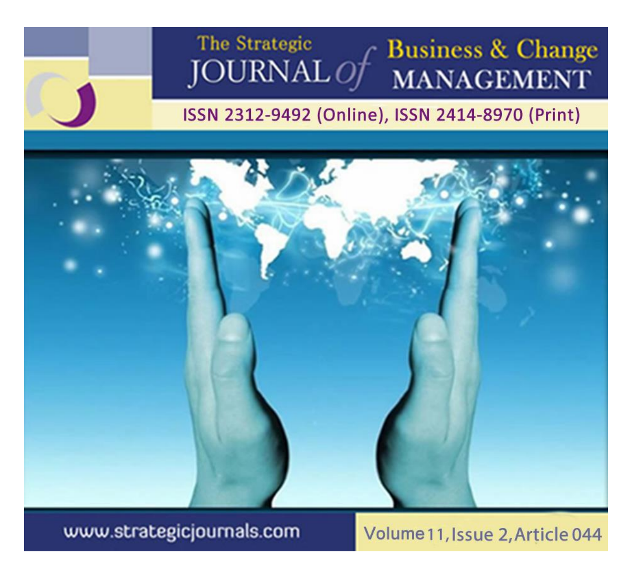
EFFECT OF EXTERNAL FACTORS ON COMPLETION OF CONSTRUCTION PROJECTS IN KENYA: A CASE STUDY OF THE DEPARTMENT OF HEALTH, MAKUENI COUNTY, KENYA