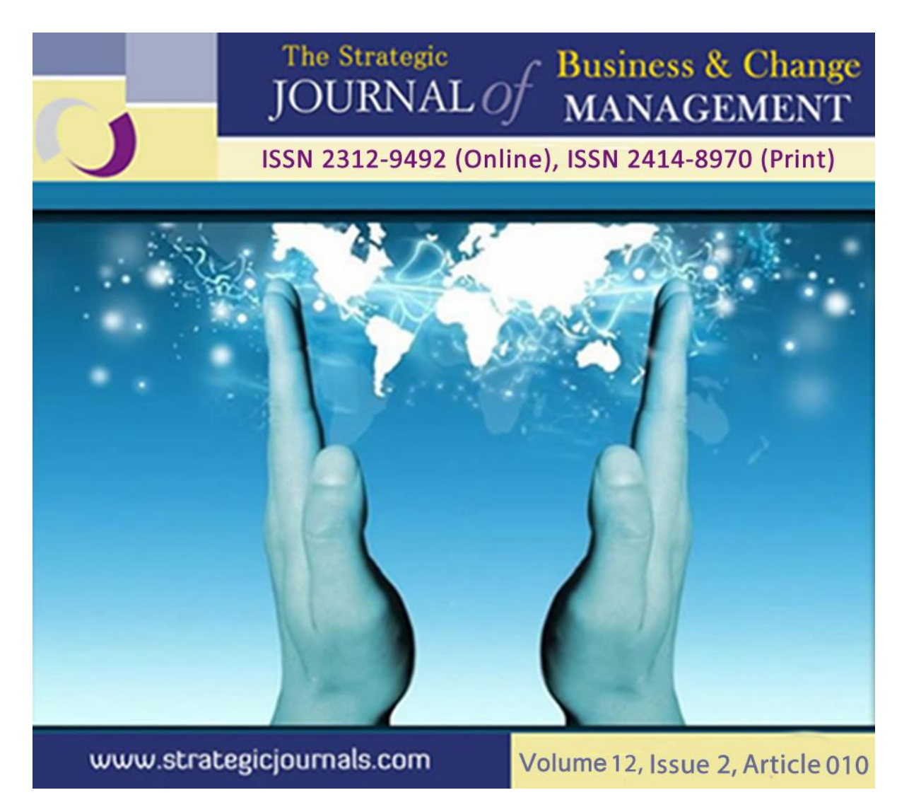
CORPORATE FINANCE GOVERNANCE PRACTICES AND FINANCIAL PERFORMANCE OF STATE-OWNED SUGAR COMPANIES IN KENYA