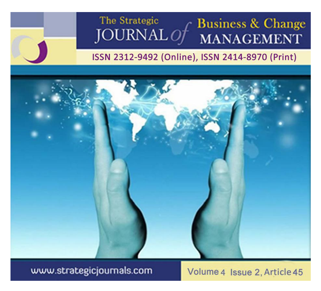
EFFECT OF BUDGETARY CONTROL ON FINANCIAL PERFORMANCE OF SAVINGS AND CREDIT COOPERATIVE ORGANIZATIONS IN NAIROBI COUNTY