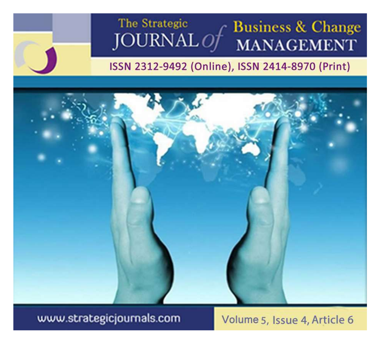
LOGISTICAL INNOVATION ON SERVICE DELIVERY IN 3PL COMPANIES IN KENYA: A CASE STUDY OF SPEDAG INTERFREIGHT LIMITED